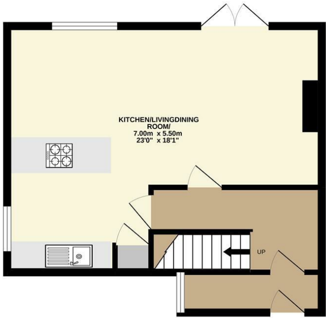
GROUND FLOOR 41.0 sq.m. (441 sq.ft.) approx.